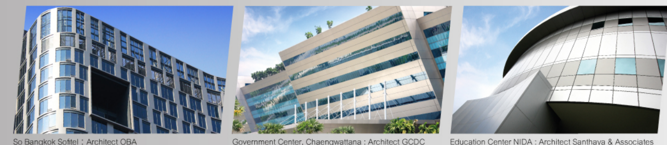
So Bangkok Sotfel : Architect OBA Government Center, Chaengwattana : Architect GDC Education Center NIDA : Architect Santhaya & Associates